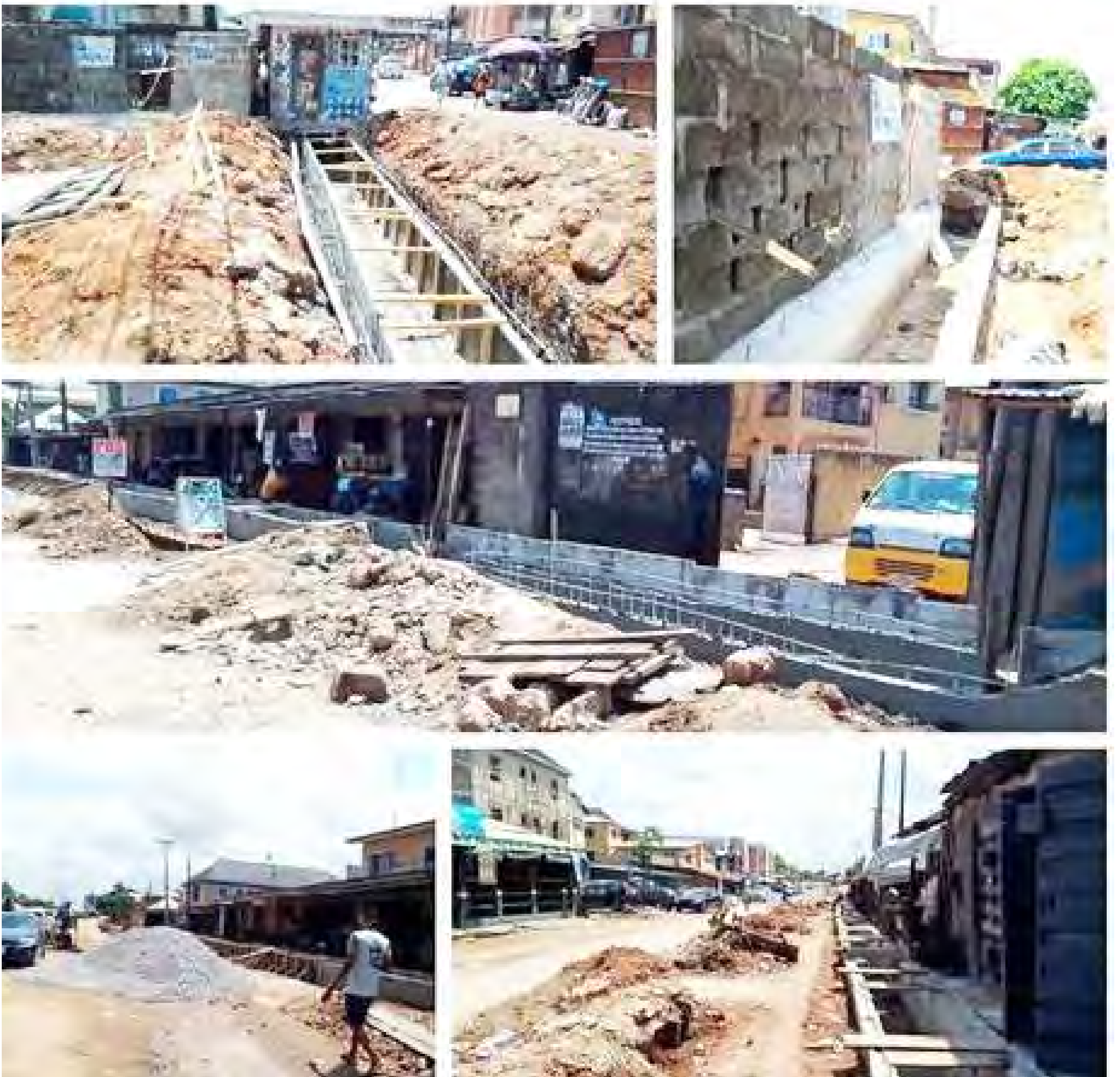
Shasere Ajlbade Street Undergoes New Look